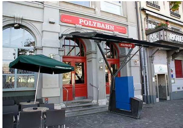
The "Polybahn" bottom station at the top of Niederdorfstrasse